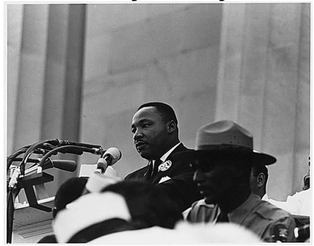
Leading the Change