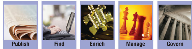
WebSphere Service Registry and Repository high-level functionality

WSRR helps ensure awareness of available applications, services and documents throughout the organization and helps optimize governance and management capabilities so you get the most business value from your SOA. It facilitates storing, accessing and managing service metadata so that you can easily select, invoke, govern and reuse your services. A key factor in SOA success is the amount of service reuse achieved. Good governance is a key to achieving service reuse, and governance requires a registry.