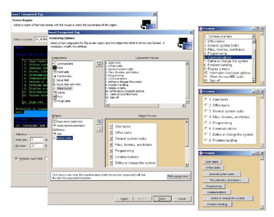
HATS Toolkit lets you quickly and easily customize your host applications.

Training new users on host applications costs time and money. Today's mobile workforce often does not have the time or inclination to learn to navigate complex, more-traditional systems. And your business partners and customers want a familiar interface on which they can become productive right away. Using HATS, you can present them with a graphical interface that makes your company look modern and up to date.