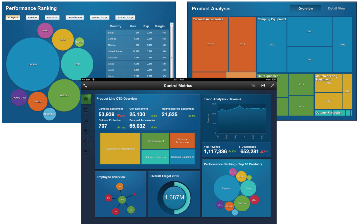
Figure 2: An intuitive interface provides self-service access to reports and analysis. Users can receive and interact with business insights on their PCs and mobile devices for greater mobility and flexibility.