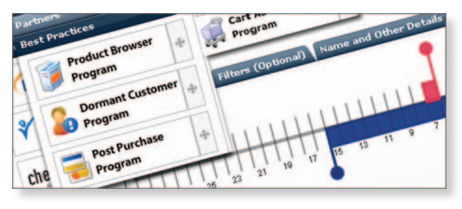
Coremetrics collaborates with leading email service providers to ensure a strong Coremetrics LIVEmail integration and together execute highly targeted email campaigns.