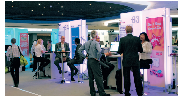
Expo Solution Centre