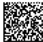
GS-1 2D Data Matrix