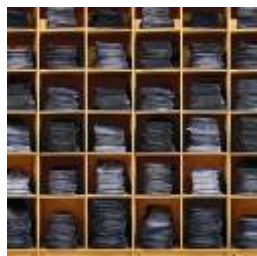
smarter solutions for retail