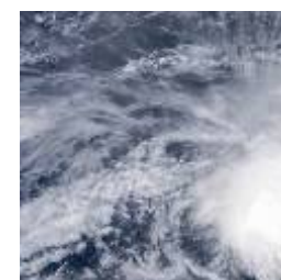
smarter water management