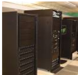
smarter data center