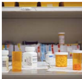
smarter safer pharmaceuticals