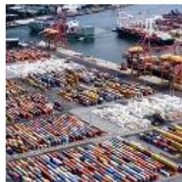
smarter supply chains