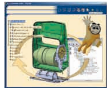
SMARTEAM User Companion Fundamentals (SUS)