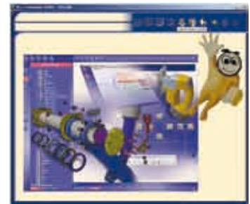
ENOVIA User Companion for VPM V5 (VNS)