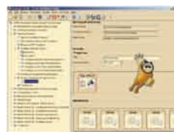
Companion Development Studio (CDS)