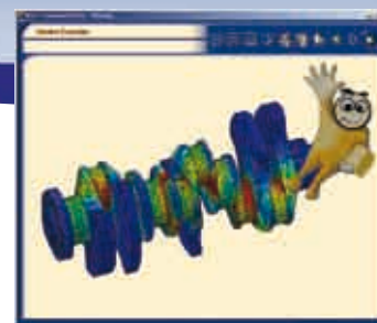
CATIA User Companion for Structural Analysis (SAS)

The Companion Development Studio provides companies with the capability to customise the WLS suite of products. Through an intuitive interface, the sophisticated companion environment allows the development of integrated learning resources for CATIA, ENOVIA and SMARTEAM products usage. One can develop, assemble brand new material while reusing existing 'skillsets', rearranging existing products to fit targeted users, and add specific company's information into this customised learning environment. The Companion Development Studio promotes also the development of sound learning objects around a proven and robust instructional design model that is currently used by the WLS suite of products. Furthermore Companion Development Studio supports a continuous improvement process for the new learning objects.