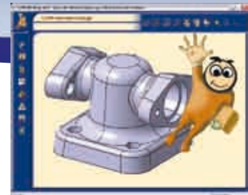
CATIA User Companion for Mechanical Design (MDS)

This CATIA User Companion for Hybrid Design completes the surface course included in CATIA User Companion for Mechanical Design. It is targeting advanced generative surface engineering.