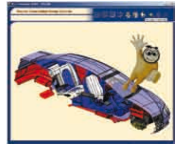
User Companion for DMU (DNS)