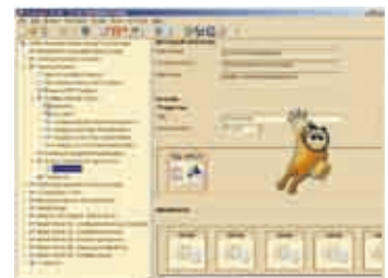
Companion Development Studio (CDS)