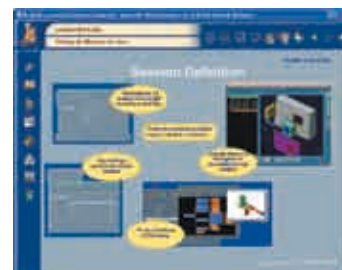
CATIA User Companion for V4 Mechanical Design Product (M4S)