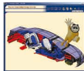
User Companion for DMU (DNS)