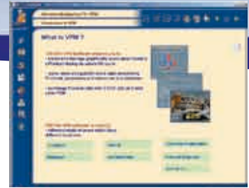
ENOVIA User Companion for VPM (VMS)

At the end of this course you will be able to work with the CATIA Integration to build the digital mock up of your product. In addition you will know how to take advantage of CATIA's workbenches to produce information based on the 3D models. This related information can be a drawing, an analysis and a manufacturing information. Moreover you will find in this course the needed information to take advantage of SMARTEAM infrastructure to work in a collaborative environment.