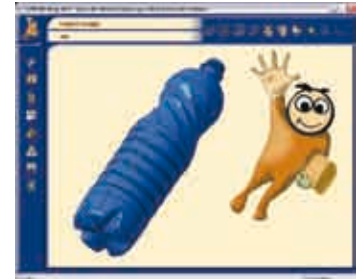
CATIA User Companion for Hybrid Design (HDS)