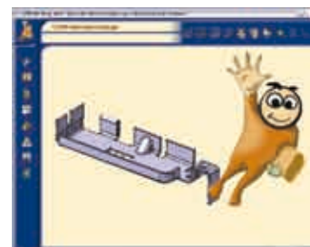
CATIA User Companion for Sheetmetal (SMS)