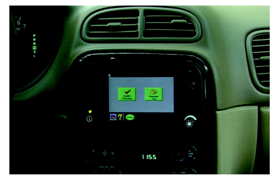
Example of IVIS telematics

Complementing this offering is IBM WebSphere Everyplace Suite, which includes DB2, MQ Series, System Management Framework and Tivoli Subscription Manager. The IBM WebSphere Everyplace Suite provides a scalable, available and security-rich end-to-end environment for executing and managing pervasive computing applications.