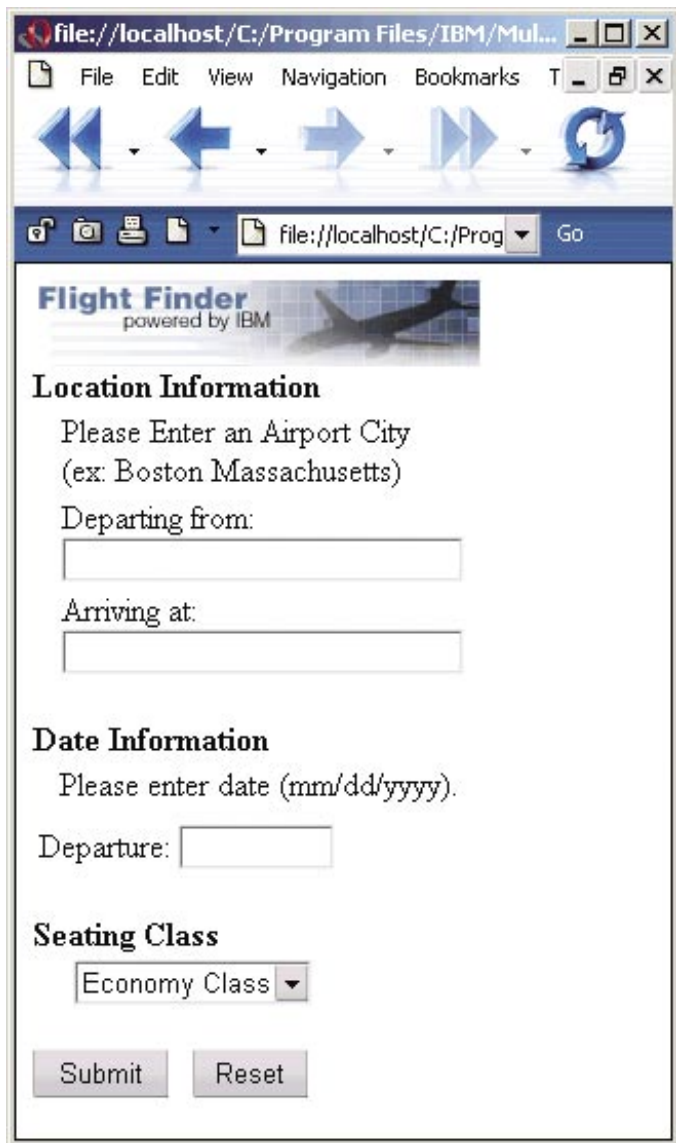
The Multimodal Web Browser rendering a multimodal application

An example is an airline flight reservation Web page that can be filled in with a combination of voice, keyboard, and stylus. The latest version of the toolkit and browser supports mixed initiative input to a Web page, which allows a user in one utterance to provide some or all the data required in any order. The application can then use directed input for any items still required. This latest version also speech-enables the browser's own navigation functions (e.g. "browser go home"). The current Multimodal Browsers support Pocket PC and Embedix clients.