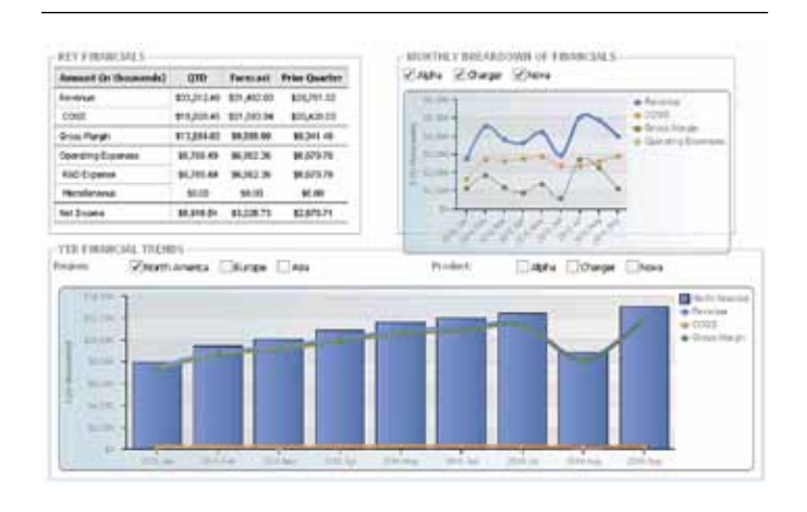
Figure 1: Information relevant to understanding your business.