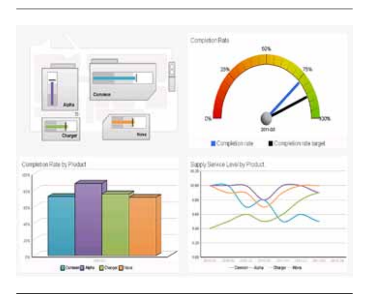
Figure 2: Interactive reporting, even when disconnected from the network.