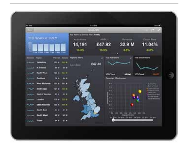
Figure 5: Simple, reliable on-demand BI and insight on your mobile device.