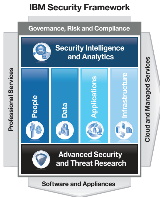
Figure 3: Treat security holistically using the IBM Security Framework.

IBM can help. Our security solutions provide comprehensive, end-to-end, integrated security capabilities on mainframes, enabling enterprises to consolidate their security management and to leverage the mainframe as their enterprise security hub.