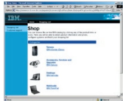
Figure 1: IBM B2B catalog sample screen