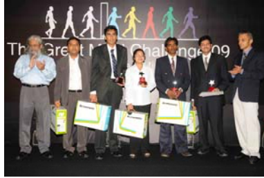
1 st Runners Up