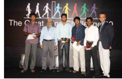
2 nd Runners Up