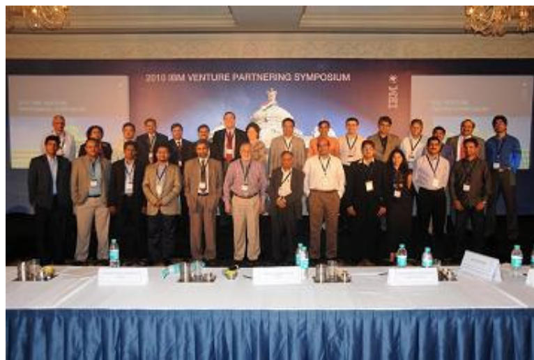
The IBM Academic Initiative Team with eminent leaders from Academia and Industry