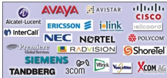
Figure 1. The April 2008 snapshot of the ecosystem of IBM Business Partners offering unified communications extensions to Lotus Sametime software

To support and surround the IBM product strategy, IBM plans to continue to invest extensively in building a rich ecosystem of IBM Business Partners including telephony, audio, video, integrated accessories (e.g., VoIP headsets, cameras, other SIP end points), IM compliance and management, value-added resellers (VARs) and value-added distributors (VADs), systems integrators, and a wide variety of independent software vendors (ISVs) that deliver industry, vertical and horizontal applications (e.g., workflow, enterprise resource planning [ERP], product lifecycle management, healthcare). IBM has more than 100 IBM Business Partners building solutions for Lotus Sametime software today. Many of these are free of charge in the Lotus Sametime plug-in catalog.