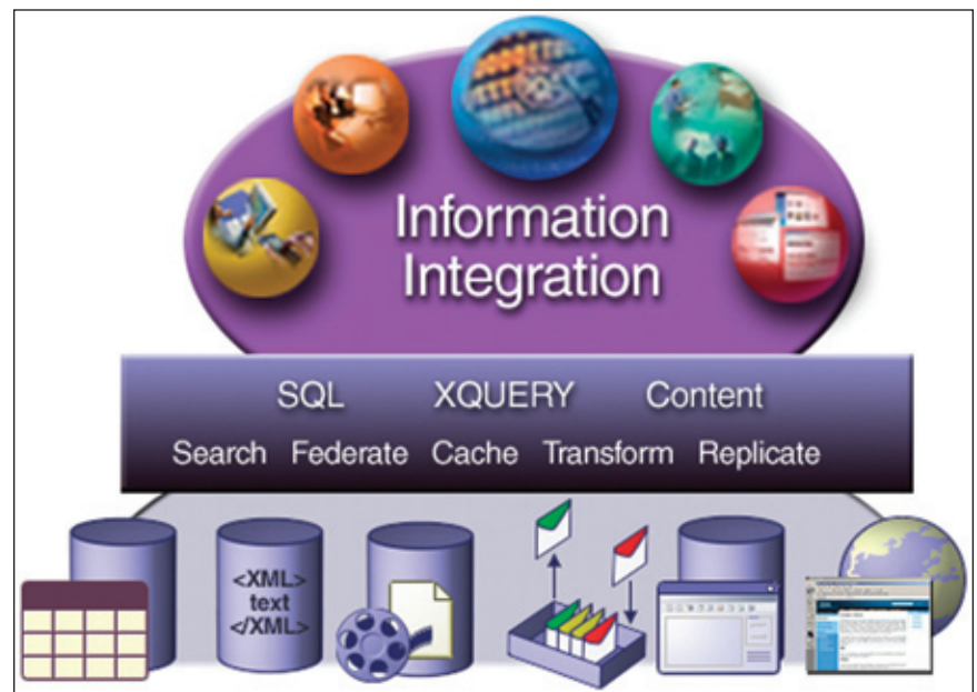
Figure 2. The IBM infrastructure provides flexible access based on a range of programming models, a rich set of integration features and interoperability with IBM's overall business integration framework.

IBM envisions an information integration infrastructure that will give the application layer a unified view of the data it must access, regardless of differences in data format, data location and access interfaces. The evolution of data management software is not simply about managing single-instance data stores, but about providing value-added integration across all forms of data, dynamically managing data placement to match availability, currency and performance requirements, and providing autonomic features that continue to reduce the burden on IT staffs for managing complex data architectures. To that end, IBM has consolidated a project, code-named Xperanto, to address customer requirements for integrating structured, semi-structured and unstructured data. Based on ongoing research investments and proven data management technologies in areas such as relational data, XML, content management, federation, search and replication, IBM is developing the integrated infrastructure shown in Figure 2.