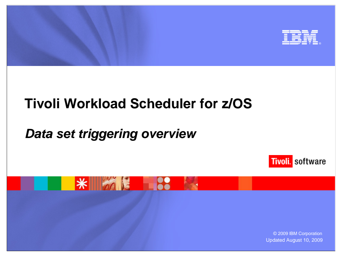
Tivoli Workload Scheduler for z/OS® data set triggering overview.

This training module provides a high level overview of the data set triggering feature of Tivoli Workload Scheduler for z/OS. Data set triggering is part of Tivoli Workload Scheduler for z/OS 8.5 Event Driven Workload Automation (EDWA).