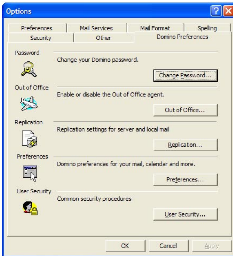
Domino preferences are integrated as part of the Options dialog box.