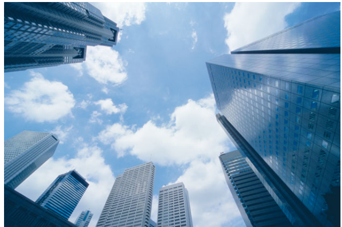
Power is Cloud Optimized

Workload-optimizing systems enable optimization of IT resources and increasing flexibility, key for cloud computing. Power is workload-optimizing systems, leveraging the new POWER7® processor-based systems designed to achieve maximum performance for both the system and its virtual machines. New Intelligent Threads technology dynamically switches the processor threading mode to deliver optimal performance for different workloads. TurboCore mode offers the option to optimize the system for frequency and cache utilization delivering the maximum per core performance for database and transaction workloads. Active Memory™ Expansion helps reduce memory costs by enabling physical memory to be logically expanded up to 100 percent for some workloads—such as SAP. ENERGY STAR-qualified POWER7 systems dynamically optimize energy use, which can save 83 percent on energy costs with 28 percent more performance. Power Systems with AIX® deliver the best RAS, with the fewest unscheduled outages, least amount of downtime and the fastest patch time. AIX and Power Systems hardware and virtualization technologies have been certified