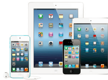
Figure 1: Sample mobile devices.