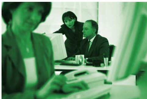
DB2 QMF is a unique business intelligence platform, providing users with immediate access to information enterprisewide.