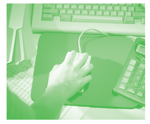
Sophisticated database applications with one consistent interface.

Whether you are building menus, forms, screens or reports, Informix 4GL software performs development functions and allows for easy integration between them, reducing the need for external development packages. Because our Informix 4GL products are source-code compatible, 4GL-generated applications are highly portable.