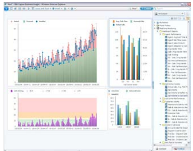
Real-time monitoring of key performance indicators (KPIs) and operational metrics from disparate data sources.

Built on a proven technology platform, Cognos 10 is designed to upgrade seamlessly and to cost-effectively scale for the broadest of deployments. Cognos 10 provides you and your organization the freedom to see more, do more—and make the smart decisions that drive better business results.