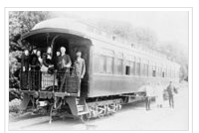
Henry Stanley and party standing on the back of an observation car at Monterey, California, March 19, 1891.

In later years he spent much energy defending himself against charges that his African expeditions had been marked by callous violence and brutality. Stanley's opinion was that "the savage only respects force, power, boldness, and decision." Stanley would eventually be held responsible for a number of deaths and was indirectly responsible for helping establish the rule of Léopold II of Belgium over the Congo Free State. In addition, the spread of African trypanosomiasis across central Africa is attributed to the movements of Stanley's enormous baggage train and the Emin Pasha relief expedition.