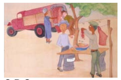
C D Seegers