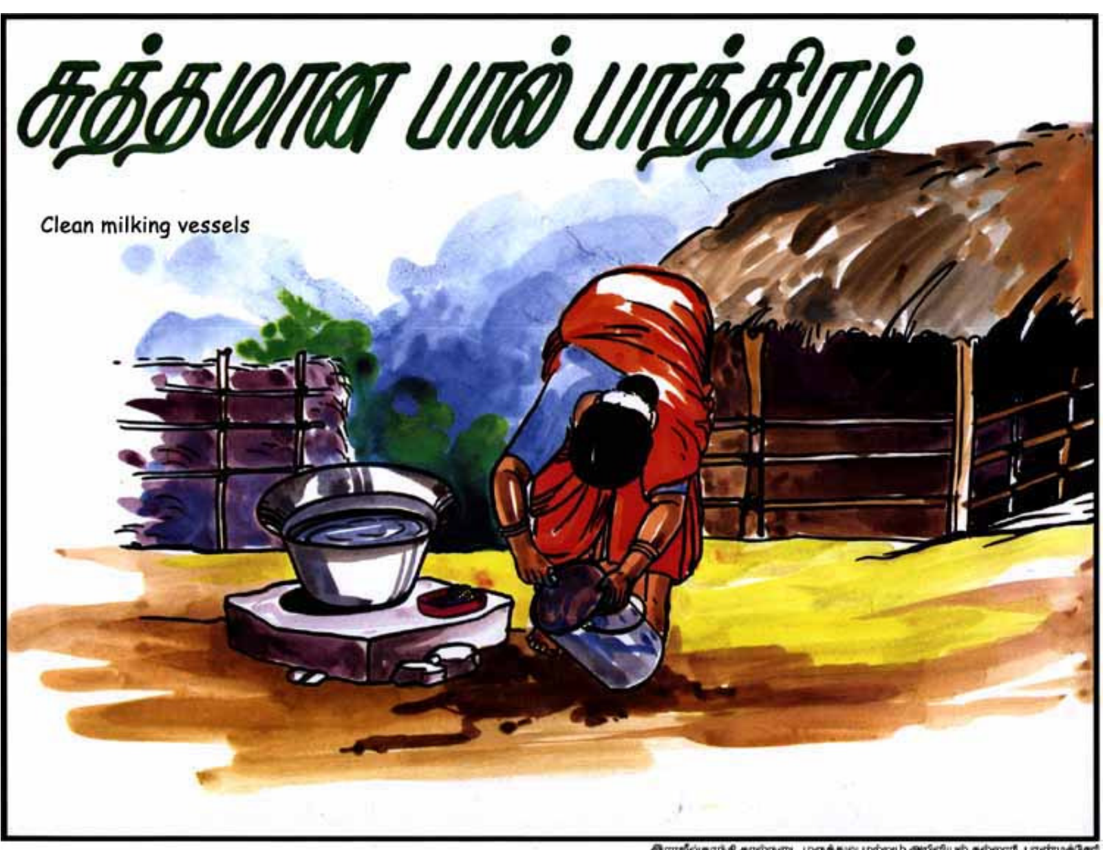
னேராவில் காந்தி கால்நடை மருத்துவ மற்றும் அறிவியல் கல்லூரி, பான்முச்சேரி