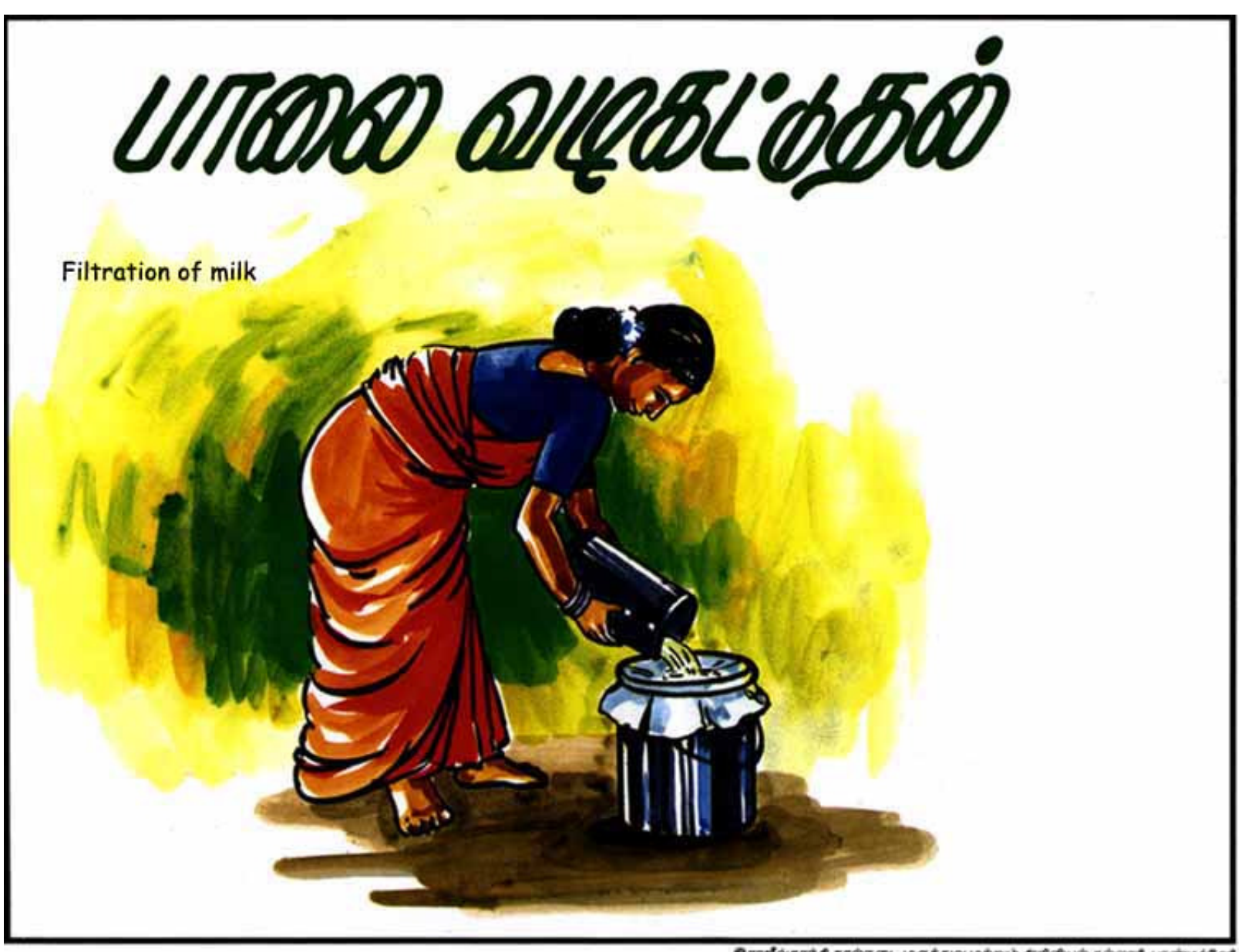
தொளிவ்காந்தி கால்நடை மருத்துவ மற்றும் அறிவியல் கல்லூர், பாண்டிச்சேர்