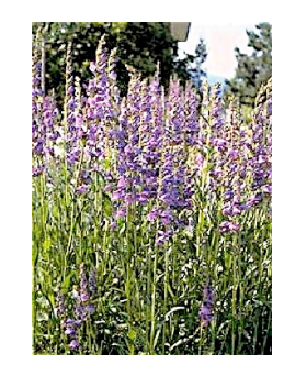
Rocky Mt. penstemon

Listen to "Farmer Fred" Hoffman on The KFBK Garden Show on Newstalk 1530/KFBK Sundays, 8:30-10 a.m.; and, Get Growing also on Sundays, 10 a.m.-Noon, on Talk650/KSTE. More garden tips at the website! farmerfred.com