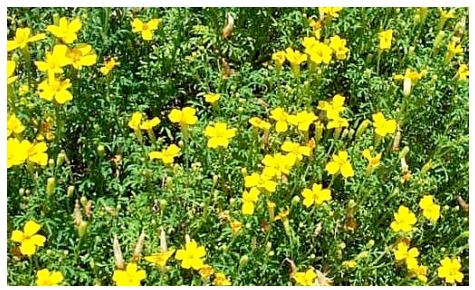
Marigold "lemon gem"