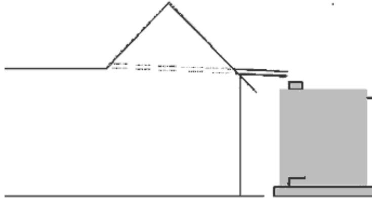
Figure 5 - Pipe has to pass through roof, from central roof courtyard, to tank