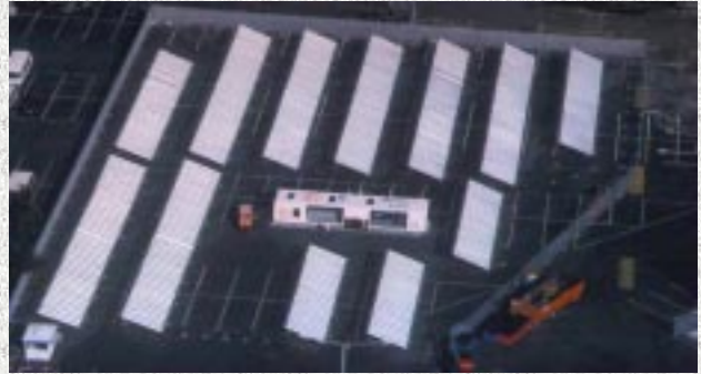
Aerial view of a CAN! facility near the Los Angeles airport