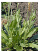
Long leaf plantain (R. lanceolata)

Here are some basic toothache remedies...especially if you do not have ANY of the above ingredients and you need toothache relief NOW!