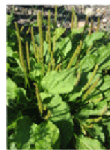
Broad leaf plantain (R. major)

Raw plantain leaves crushed and placed on the aching tooth will also help stop a toothache. If you happen to have a little salt with you, mix a little salt with the chewed leaves. To read more about plantain, click here .