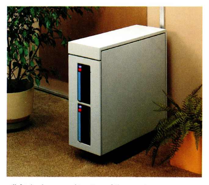
will fit the best combination of these subsystems to your requirements, providing expandable power—from two to 47 million bytes—which grows with your needs.