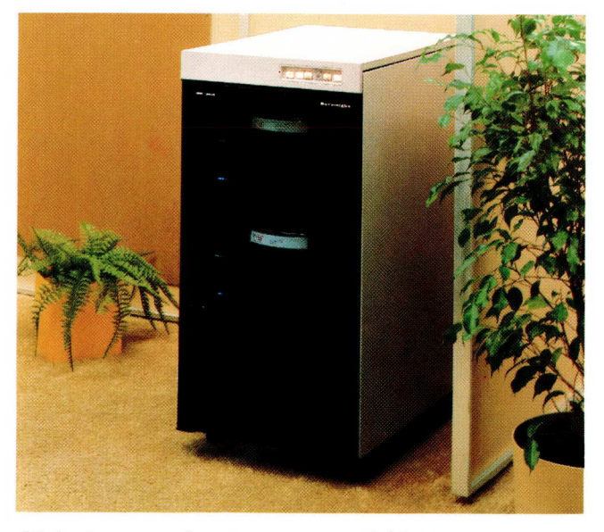
Disk storage subsystems are available to meet your particular needs. Shown from left to right are Burroughs Super Mini-Disk II, cartridge disk, Super Mini-Disk and fixed disk. Your Burroughs representative