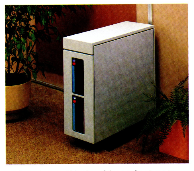
will fit the best combination of these subsystems to your requirements, providing expandable power—from two to 24 million bytes—which grows with your needs.