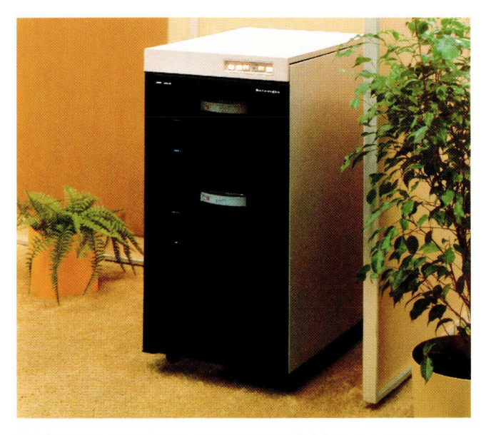
Disk storage subsystems are available to meet your particular needs. Shown from left to right are Burroughs Super Mini-Disk II, cartridge disk, Super Mini-Disk and fixed disk. Your Burroughs representative