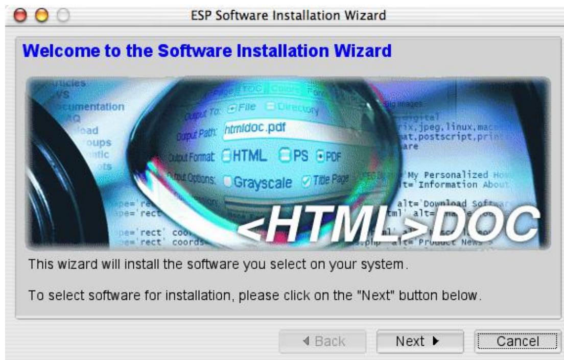
Figure 1-2: The software installation wizard

Double-click on the Install icon in the Finder window to start the software installation wizard (Figure 1-2) and follow the installer prompts.