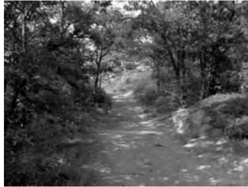
Blue Hills Reservation

Located only minutes from the bustle of downtown Boston, the DCR Blue Hills Reservation stretches over 7,000 acres from Quincy to Dedham, Milton to Randolph, providing a green oasis in an urban environment. Rising above the horizon, Great Blue Hill reaches a height of 635 feet, the highest of the 22 hills in the Blue Hills chain. From the rocky summit visitors can see over the entire metropolitan area. With its scenic views, varied terrain and 125 miles of trails, the Blue Hills Reservation offers year-round enjoyment for the outdoor enthusiast.