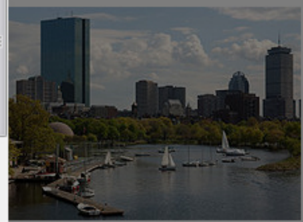
View of Back Bay, seen from the Charles River, featuring Boston's two tallest buildings, the John Hancock Tower (left) and the Prudential Tower (right)