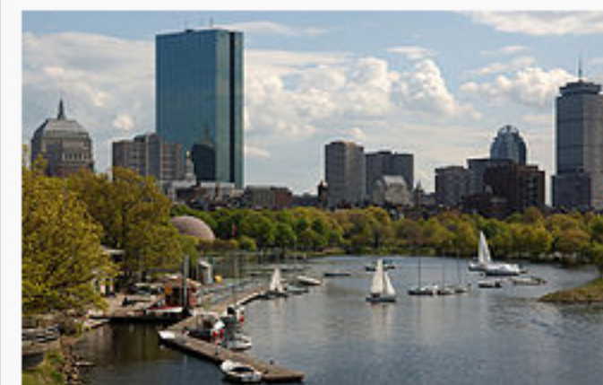
Skyline of Back Bay, seen from the Charles River, featuring Boston's two tallest buildings, the John Hancock Tower (left) and the Prudential Tower (right)