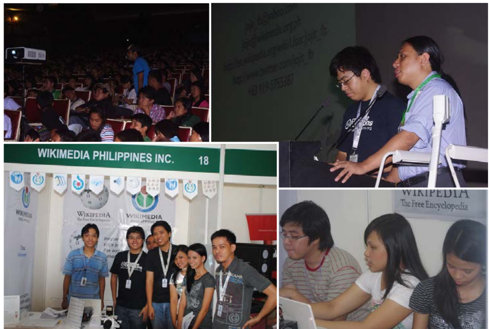
Wikimedia Philippines at the Youth Congress in Information Technology

The four-day event attracted more than 20,000 participants, mostly students from various colleges and universities all over the Philippines. Members of the academe and several IT professionals were also present. A total of 2,442 visitors who passed by WMPH's booth and signed the guestbook took with them Wikipedia souvenir pens.