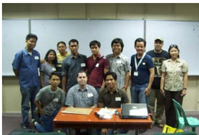
Participants of the First Annual Meeting