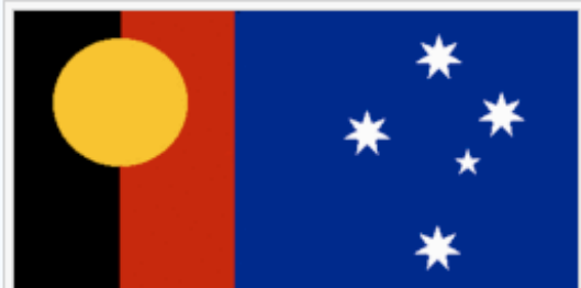
For an Australian flag and an Australian republic!