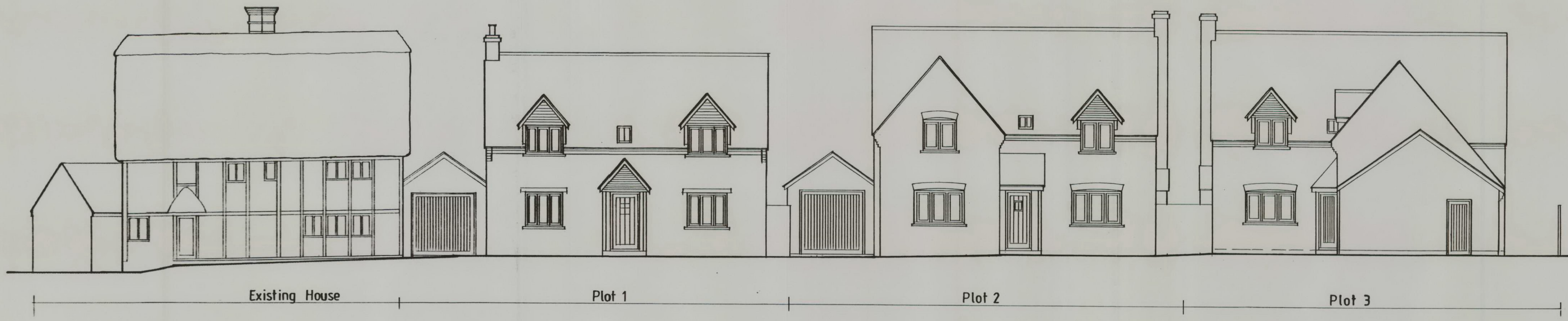
East Side of Private Road Street Scene