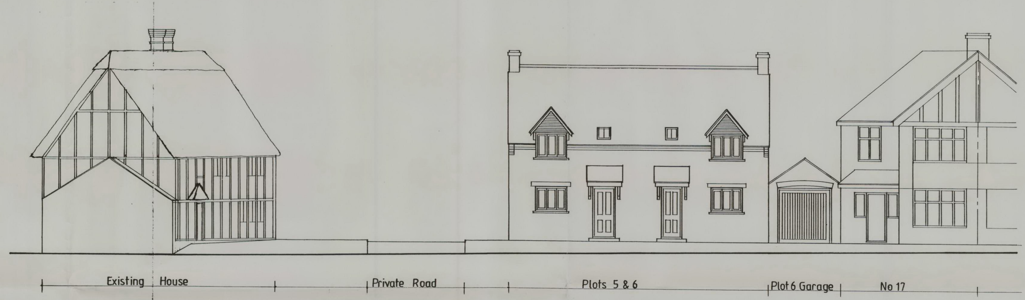
London Road Street Scene