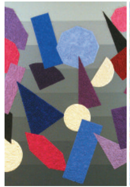
David Rappaport Confetti © 1991 Mixed Media on Canvas 48" x 48"