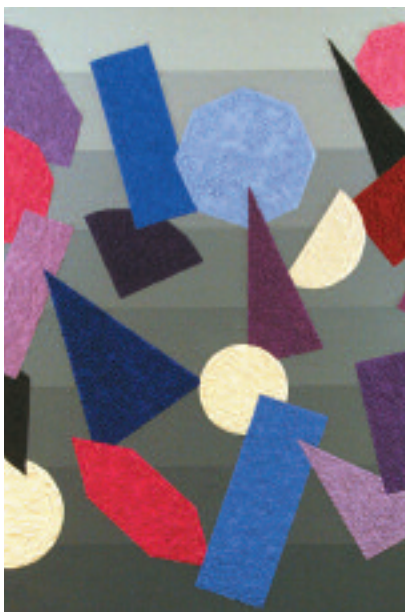
David Rappaport Confetti © 1991