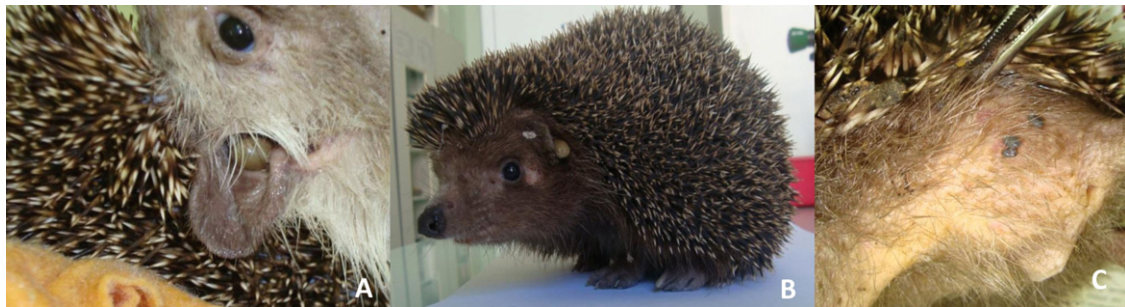
Fig. 1. (A) Rhipicephalus sanguineus on the inside of the right ear of a female Aterix algirus at the Ouled Mansour site (M'sila). (B) Rhipicephalus sanguineus on the outside of the left ear pavilion of a female Aterix algirus at the Ouanougha site (M'sila). (C) Engorged ticks on the backside of Aterix algirus hedgehog at the Hammam Dalaa (M'sila).

were identified as either Haemaphysalis erinacei adults or Rhipicephalus sanguineus adults [14].