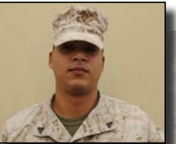
"Batman. He is just awesome."