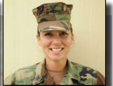
"When I wore a hanbok, a traditional Korean outfit. I felt like a princess."