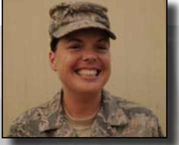
"My gypsy costume is my favorite because my son always says, 'Mommy looks pretty' when I wear it."