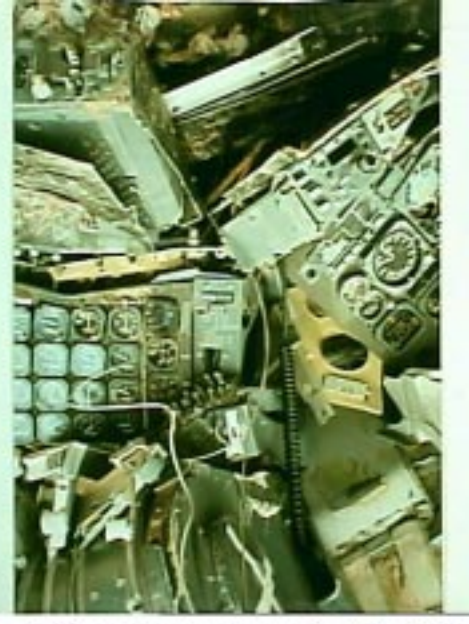
Photo 12: F/O Instr Panel, Portion of Auto Flt Control Panel, Center Instr Panel