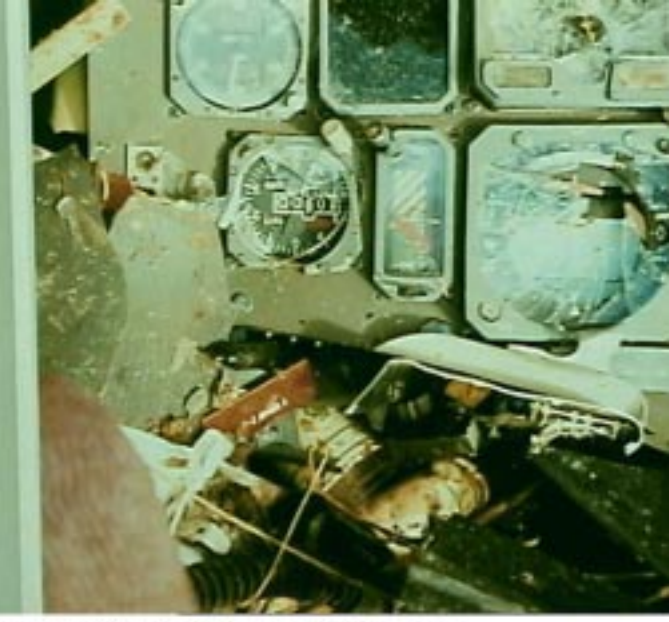
Photo 10: Close-up of First Officer's Instrument Panel (as viewed at scene)