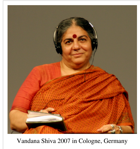
Vandana Shiva 2007 in Cologne, Germany

Vandana Shiva was born in the valley of Dehradun, to a father who was the conservator of forests and a farmer mother with a love for nature. She was educated at St Mary's School in Nainital, and at the Convent of Jesus and Mary, Dehradun. [8] After receiving her bachelors degree in physics, she pursued a M.A. in the philosophy of science at the University of Guelph (Ontario, Canada) in 1977, with a thesis entitled "Changes in the concept of periodicity of light". [9] In 1978, she completed and received her Ph.D. in philosophy at the University of Western Ontario. Her thesis, titled "Hidden variables and locality in quantum theory," [5] was about the philosophical underpinnings of quantum mechanics. She later went on to interdisciplinary research in science, technology, and environmental policy at the Indian Institute of Science and the Indian Institute of Management in Bangalore.