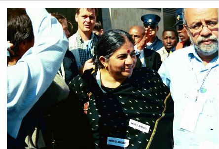
Vandana Shiva in Johannesburg, 2002