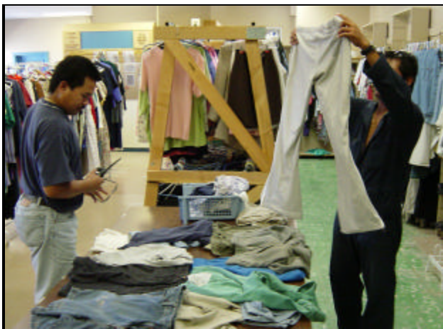
Patrons in the thrift shop look through clothes to find a bargain.

And while the FRG has been its own family while the soldiers have been away, they all look forward to seeing their loved ones again and getting their real family members back.