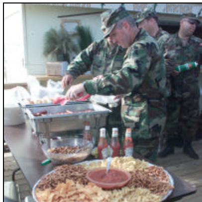
Soldiers dig in at the Grand Opening of Club Survivor last Friday.

To add to the amazing view, there's volleyball (sand is on the way), horse