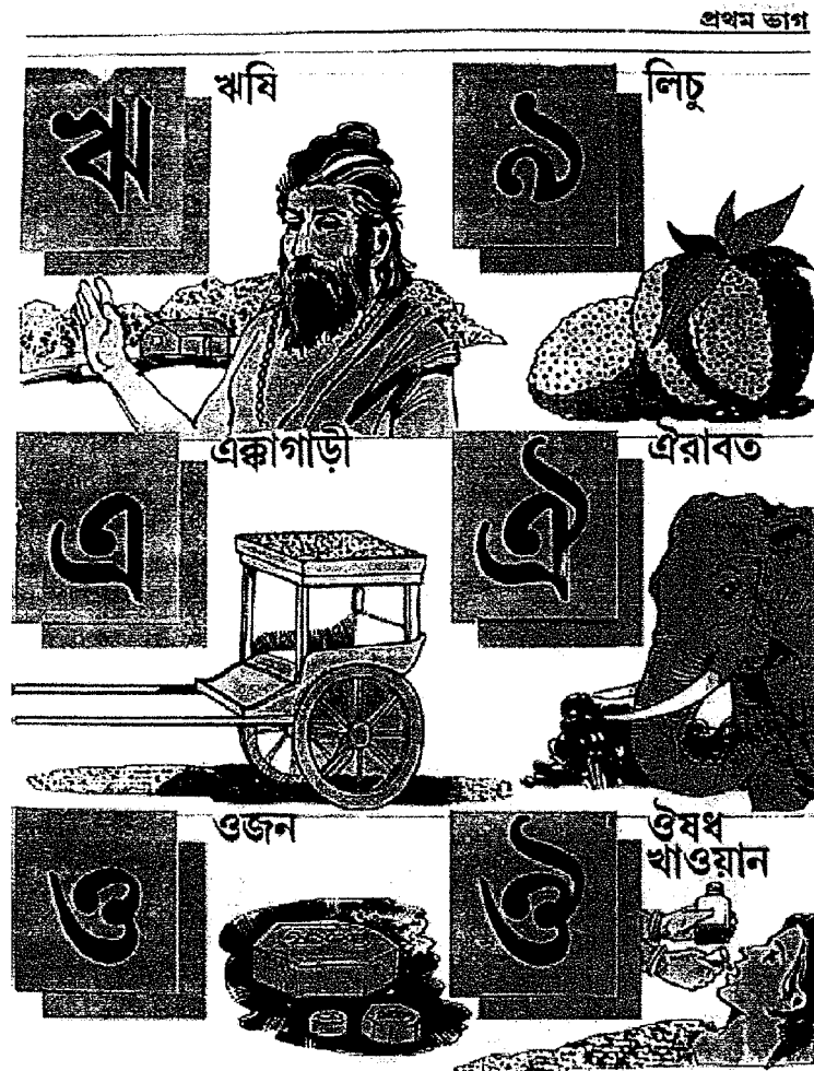
Figure 1.1 Ill-conceived illustrations.

came after eight years of involvement with using the primer. Since I do not consolidate instruction for the teacher except in response to a felt need, it was only then that I was letting the teacher at one school take down hints as to how to teach the students at the lowest level. As I continued, I realized the primer had pre-empted me at every step! I hope the impatient reader will not take this to be just another anecdote about poor instruction. And I hope I have made it clear by now that, in spite of all the confusion attendant upon straying from the beaten