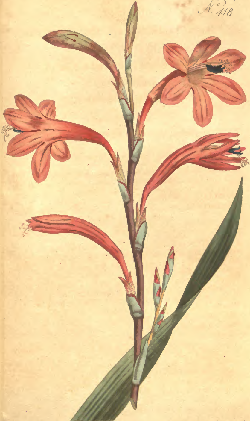
Pub. by W. Curtis. S t Geo. Crescent Sep. 1. 1798.