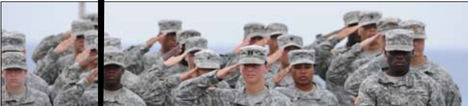
Soldiers with the 525th Military Police Battalion present arms for colors