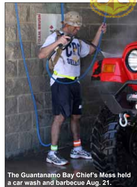
The Guantanamo Bay Chief's Mess held a car wash and barbecue Aug. 21.